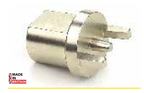
The Monument Grip+ Sink Strainer/ Rose Tool (T6) holds strainer/ rose in place whilst nut can be tightened from below. NOTE Not included in the Grip+ Accessory Kit