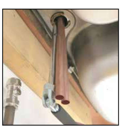
4562P fit box spanners 8-13mm. When used with 345V or 4537G handles gives improved access, extension and leverage.