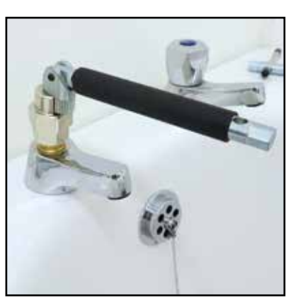
4534X has 18mm A/F socket which fits some tap cartridges

The articulated head of the basin wrench allows for improved access, reach and leverage behind and under sinks and baths. Grip+ tools fit Monument 345V and 4537G Basin Wrenches and also fits 341J and 349H basin wrenches