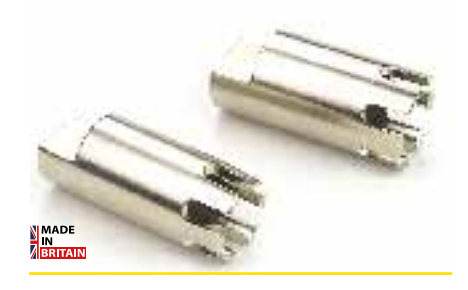
The Monument Grip+ Recessed Nut Tool 18mm castellated tool. (4529I 18mm A/F recessed valve key, 4530L 22mm A/F recessed valve key)